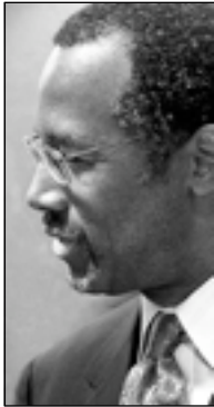
Dr. Ben Carson

O f course they didn't like it but they didn't dare refuse. And in reading two books a week, then talking about them to his mother, Bennie raised his reading scores. And because the entire curriculum is tied to reading, the rest of the report card began to improve. Each semester, each year, the scores rose. And by the time he was a senior in high school he was third in his class, scoring in the 90th percentile of the nation.