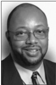
Leonard Pitts Jr.

Surely there came a point when the poor woman secretly regretted having taught the bespectacled child his ABCs, but she never let on. Just nodded and exclaimed in all the right places and when the story was done, sent me off to clean up my room or wash my hands for dinner.